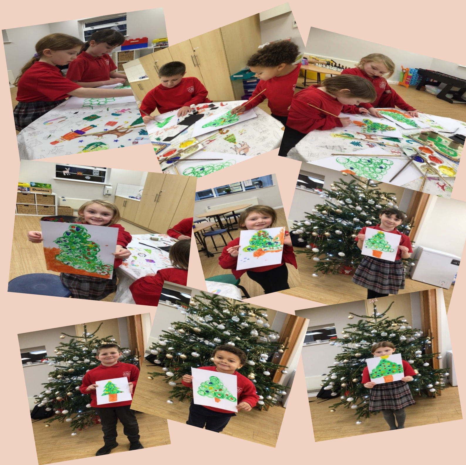
Christmas activities in the after school Lion Club.