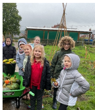
Picking pumpkins ready to carve them...