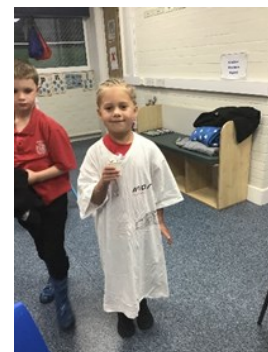
Getting our bird feeders ready for our outside environment...