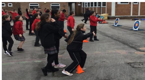
Cheering their team on

Fierce competition on Thursday afternoon between Years 5 and 6 in an Archery Competition. It was a very close run competition with lots of good-humoured rivalry.