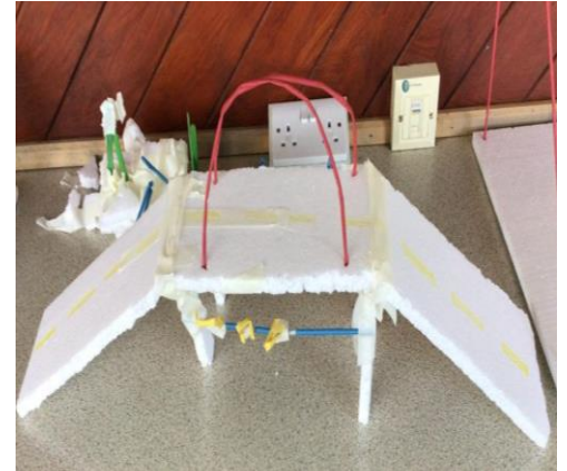
Successful bridge created.