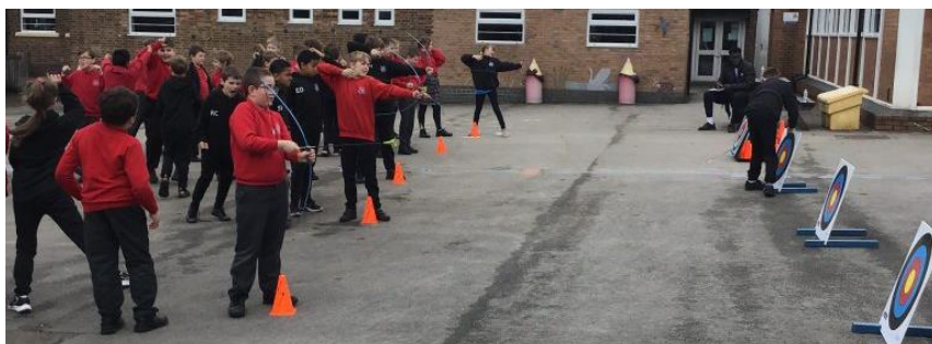
Hmm? Do we aim at the actual target or the human target?