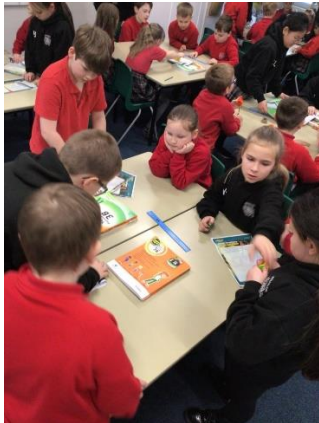
The planning meeting discussions

The classes then worked together to complete their build, keeping to their budget as well as working well as teams within the time provided.