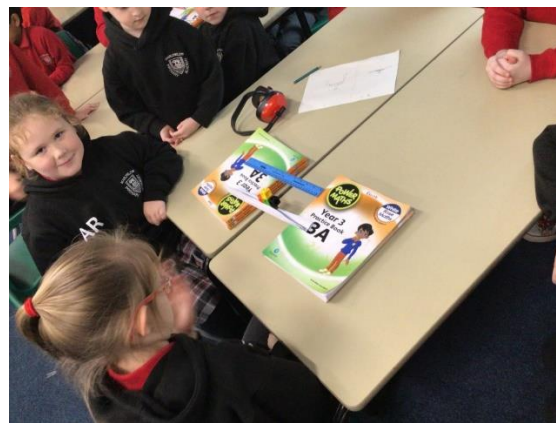
Trying out the plans