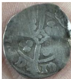
A penny from 750 years ago.

Clothes worn then didn't have pockets. Women folded up their aprons to carry things in, such as food/sticks or cones for the fire etc.