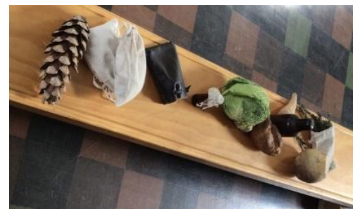
Examples of items used for fuel and food.