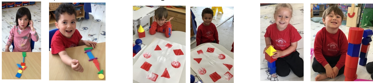
Making pictures with 2-D shapes

Foundation Stage 1 have been exploring and playing with different 2D and 3D shapes. We think the patterns made are amazing. Well done children!